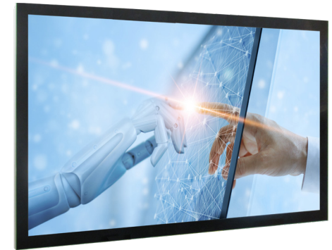
Monitor with bezel